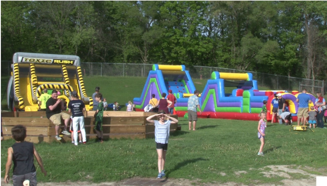
The bounce houses were a big hit and had lots of action Friday night!