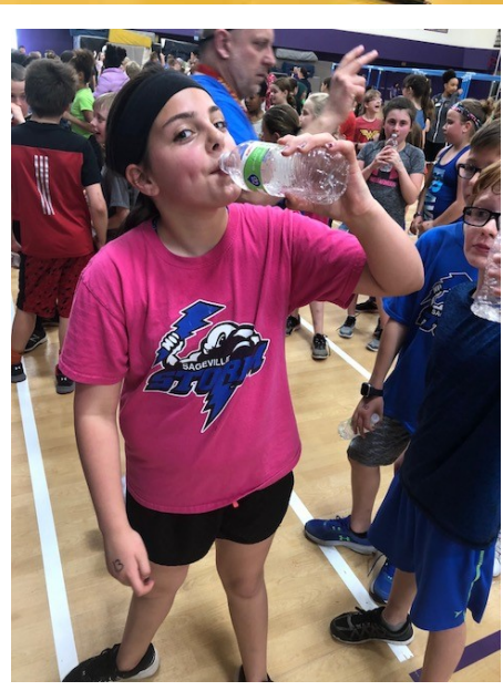
Grade 4 Go the Distance trip